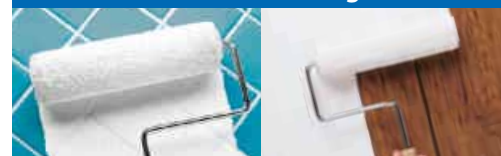
Ceramic tiles Panelling