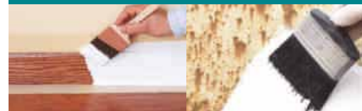
Wax-free varnishes Steel & galvanised metal