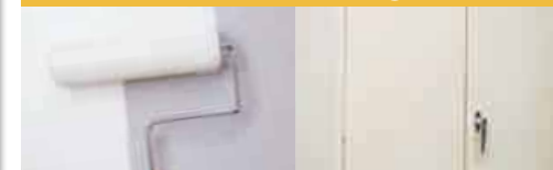
Formica® Metal cabinets