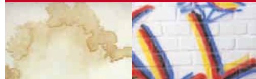
Water stains Graffiti