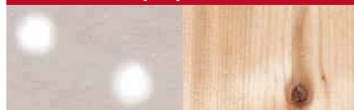
Filler repairs Knots