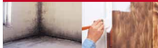
Fire Damage Musty mould & mildew