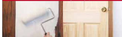
Kitchen cabinets Trim & Doors