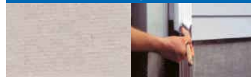
Bare drywall Chalky aluminium siding