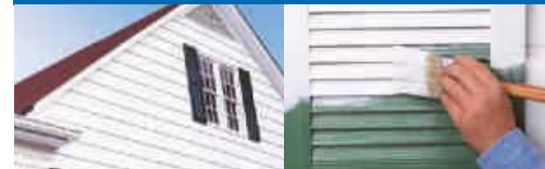
Exterior wood GRP/shutters