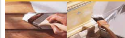
Wood siding Wood trim